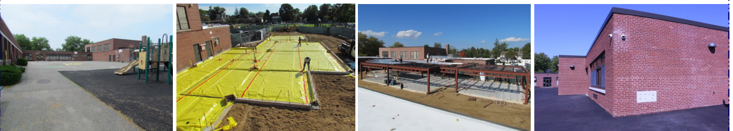
Watson Elementary Addition

Installation of air-conditioning is an ongoing project that began in 2014 and will continue through May 2016 when all classrooms in the District will be air-conditioned. At Hewitt Elementary School, an upgrade of the electrical system is necessary before the completion of air-conditioning can take place. We are working with the Rockville Centre Village to complete this work.