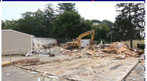
South Side High School Portable Demolition