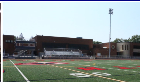
Press box, bleachers and field at SSHS