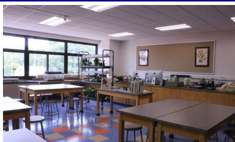
New Bio-Art classroom at SSHS