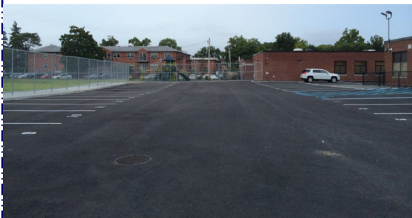
Reconfigured parking lot at Watson

Your patience during the construction of the north addition at South Side High School and the addition at Watson Elementary School was greatly appreciated. We ask for your understanding once again during the 2015/2016 school year as we continue with the construction of the south addition at South Side High School.