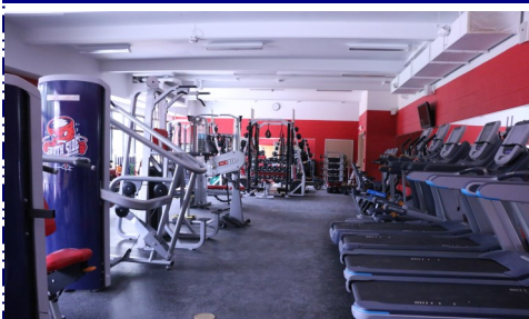
New Fitness Center at SSHS