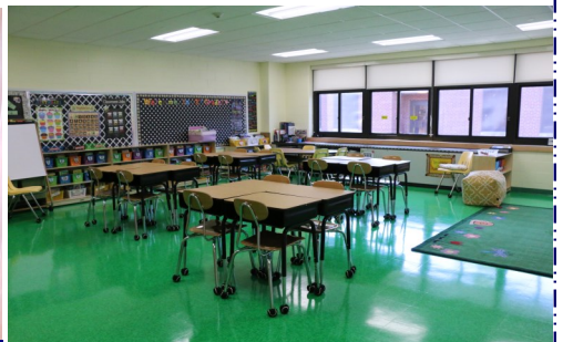
New classroom at Watson