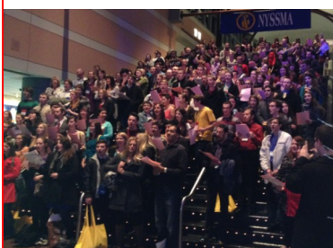
Holiday sing along on steps of the convention center.

Five South Side High School students were selected to go to Rochester, NY and perform in All State Ensembles. Congratulations to the following students on being selected for this prestigious honor: