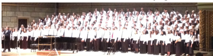
All State Mixed Chorus

All State Wind Ensemble All State Mixed Chorus All State Mixed Chorus All State Mixed Chorus All State Symphonic Band