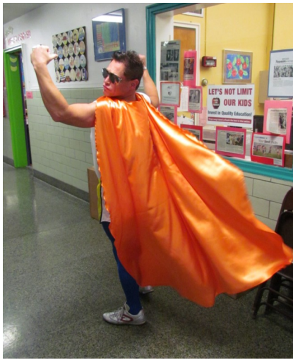
Captain Covert Makes his big debut for Students