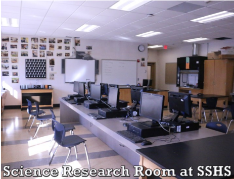
Science Research Room at SSHA