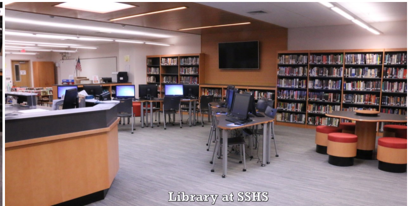
Library at SSHA