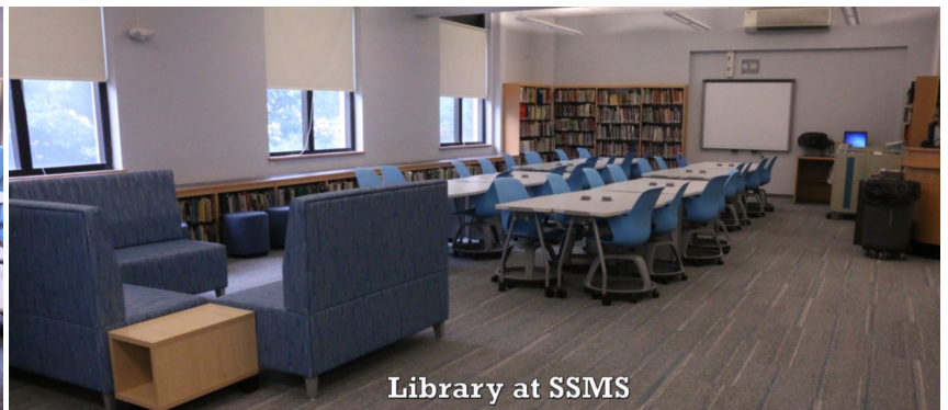
Library at SSMS