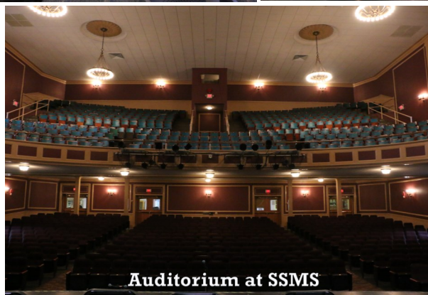
Auditorium at SSMS