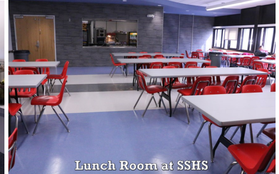
Lunch Room at SSHA