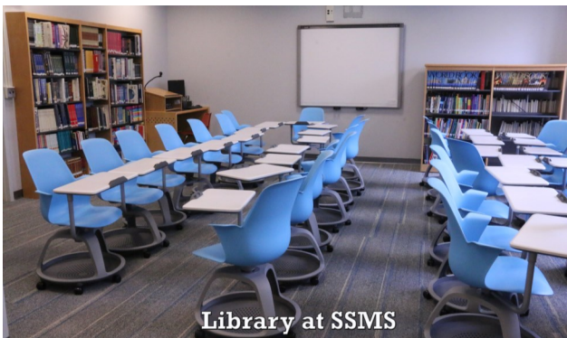
Library at SSMS