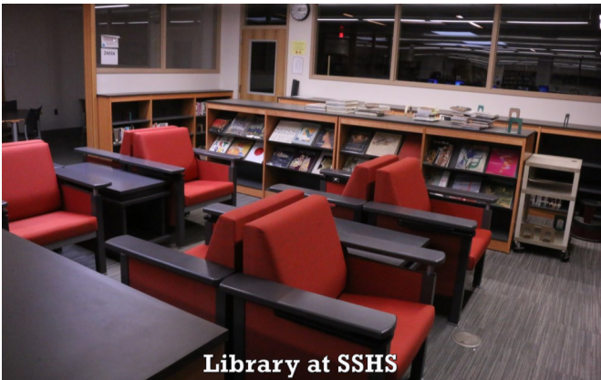
Library at SSHA