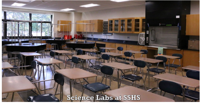
Science Labs at SSHA