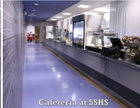
Cafeteria at SSHA