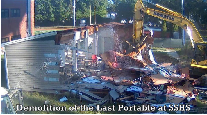
Demolition of the Last Portable at SSHA