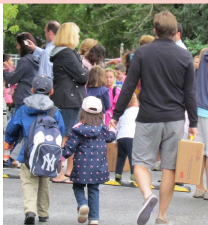
At Wilson a parent escorts his children to lineup outside of the building on the first day of school.

Wilson School has gotten off to a terrific start this year. All facets of the building and grounds are in operation, the lunch program is in place, transportation is on time and reliable and our classes and programs are going well. Team meetings on the building and District levels have begun, and our staff is very focused and engaged in the beginning of school activities and completion of all required tasks. With Back-to-School Night around the corner, we are excited at the prospect of Wilson parents getting a better look at what their children will be doing for the remainder of the school year.